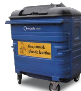
Taylor Continental™ Recycling