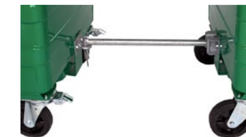
Taylor Continental™ Towing