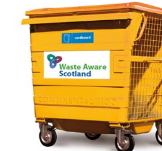
Taylor Continental™ Cage