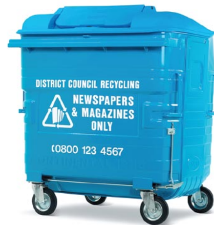
Taylor Continental™ 1280L