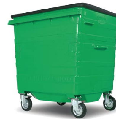
Taylor Continental™ 1100L