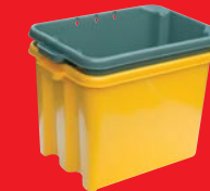
Domestic Kerbside Recycling Boxes