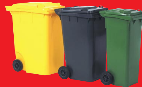
Domestic Wheeled Bins