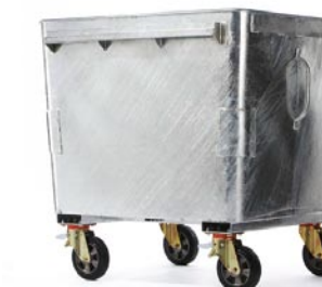
Taylor Continental™ Compactor Bin