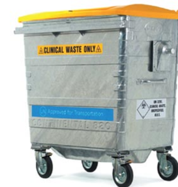
Taylor Continental™ 820L