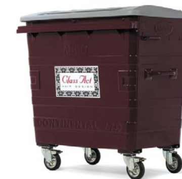
Taylor Continental™ 770L