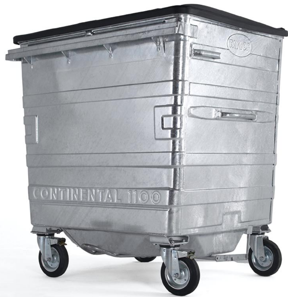
Taylor Continental™ 1100L

The Taylor Continental™ has become the global standard, market leading range of 4 wheeled waste containers. They are used by councils and waste management companies around the world in some of the harshest environments. They are designed and built to perform and provide a long, valuable life of service, able to withstand exceptionally heavy use, vandalism and contain accidental fires.