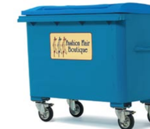
Taylor Continental™ 500L