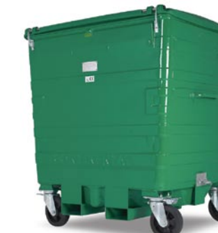
Fork Lift Pockets at base or mid-height