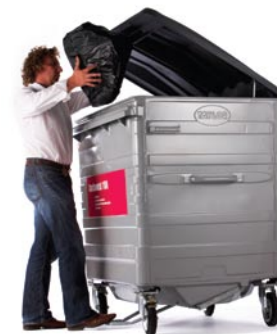
Taylor Continental™ Hands Free