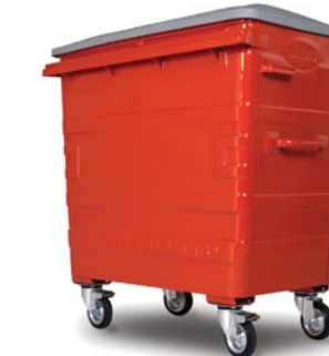
Taylor Continental™ 660L