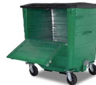
Taylor Continental™ Dropdown